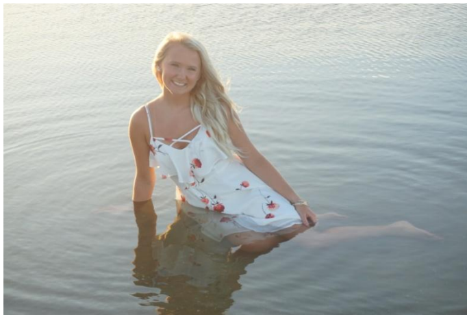
Landscape Style Picture