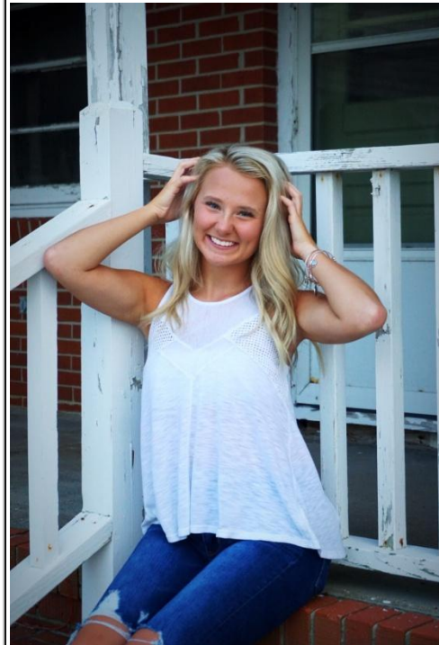
Portrait Style Picture

While you might like the picture in the landscape setting, be aware that the Senior Picture pages are set up in the portrait format. The picture to the right is an example of a portrait style photo.