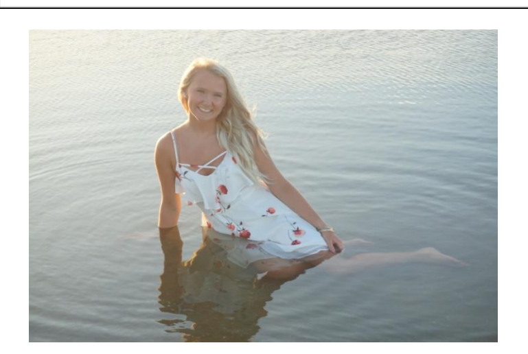
Landscape Style Picture