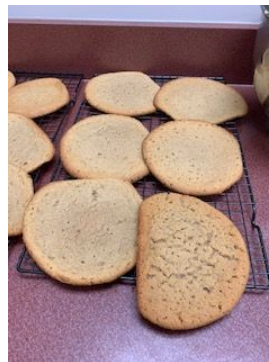
Peanut Butter Cookies