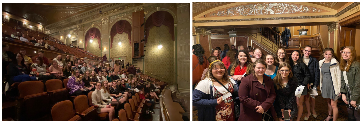
The Students watching “Cats.”

Students from the music department traveled to the Benedum center in Pittsburgh on February 25th to see “Cats” the musical. The students also enjoyed a formal meal at “The Melting Pot.”